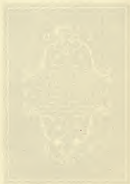
Faint text or caption located directly below the illustration, which is illegible due to fading.